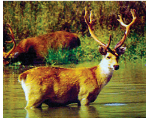
Fig. 7.6 : Barasingha

animals has become difficult because of disturbances in their natural habitat. Professor Ahmad tells them that in order to protect plants and animals strict rules are imposed in all National Parks. Human activities such as grazing, poaching, hunting, capturing of animals or collection of firewood, medicinal plants, etc. are not allowed