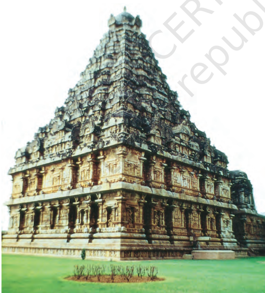
Fig. 3 The temple at Gangaikondacholapuram. Notice the way in which the roof tapers. Also look at the elaborate stone sculptures used to decorate the outer walls.

Chola temples often became the nuclei of settlements which grew around them. These were centres of craft production. Temples were also endowed with land by rulers as well as by others. The produce of this land