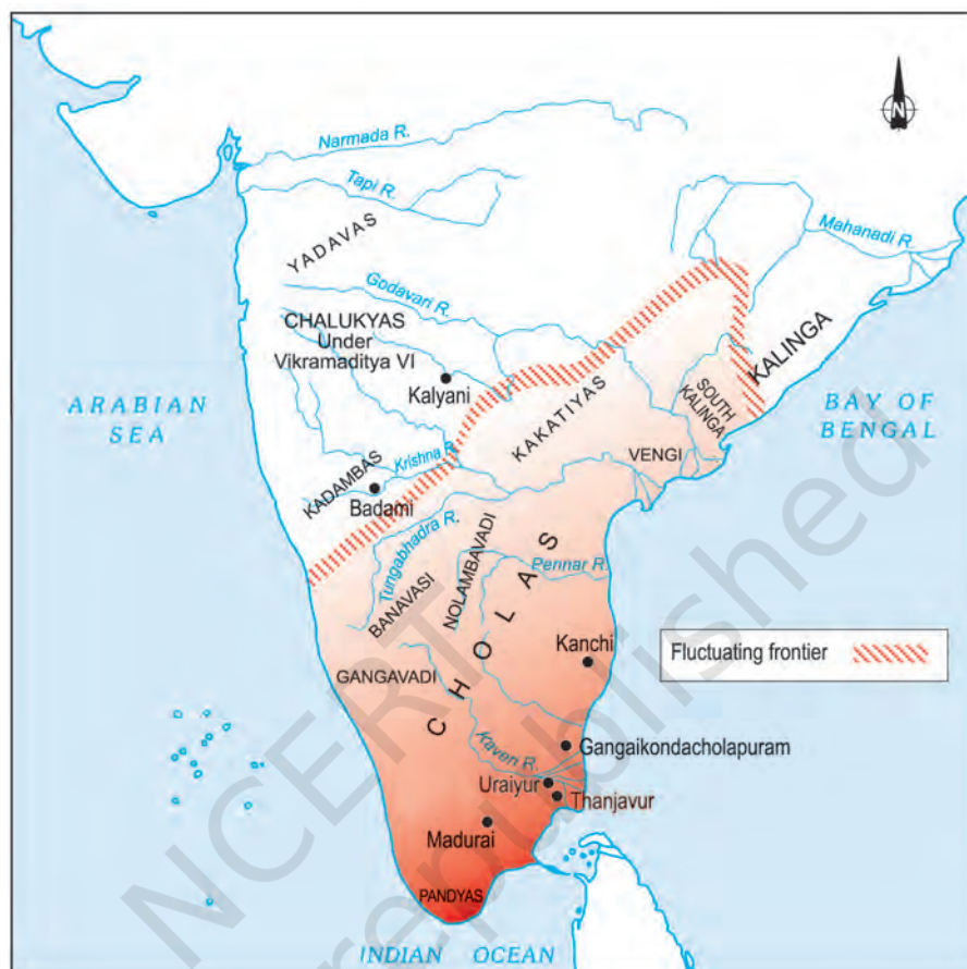
Map 2 The Chola kingdom and its neighbours.