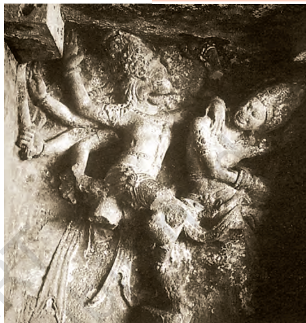
Fig. 1 Wall relief from Cave 15, Ellora, showing Vishnu as Narasimha, the man-lion. It is a work of the Rashtrakuta period.

Many of these new kings adopted high-sounding titles such as maharaja-adhiraja (great king, overlord of kings), tribhuvana-chakravartin (lord of the three worlds) and so on. However, in spite of such claims,