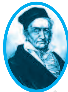
Carl Friedrich Gauss (1777 – 1855)

Carl Friedrich Gauss is often referred to as the 'Prince of Mathematicians' and is considered one of the three greatest mathematicians of all time, along with Archimedes and Newton. He has made fundamental contributions to both mathematics and science.