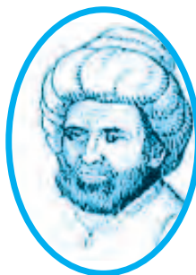
Muhammad ibn Musa al-Khwarizmi (C.E. 780 – 850)

A lemma is a proven statement used for proving another statement.